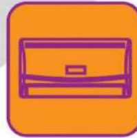
ECO AIR CONDITIONER