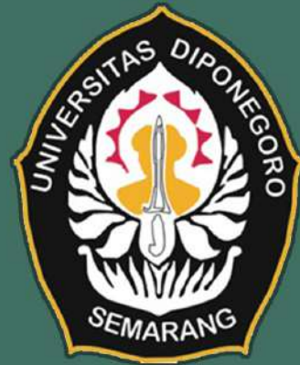
logo of Diponegoro University

The decision was retroactive to October 15, 1957, and this date is commemorated as the day of Diponegoro University's Dies Natalis as well as for remembering "Five Days Battle in Semarang", which is part of Indonesian National Revolution war that took place in Semarang