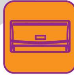
ECO AIR CONDITIONER ▼ 20-40%