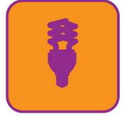
LED LIGHT ▼ 20-40%

▼ 20% RATIO OF RENEWABLE ENERGY PRODUCED TOWARDS ENERGY USED