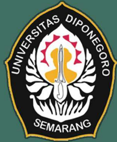
logo of Diponegoro University

The decision was retroactive to October 15, 1957, and this date is commemorated as the day of Diponegoro University's Dies Natalis as well as for remembering "Five Days Battle in Semarang", which is part of Indonesian National Revolution war that took place in Semarang